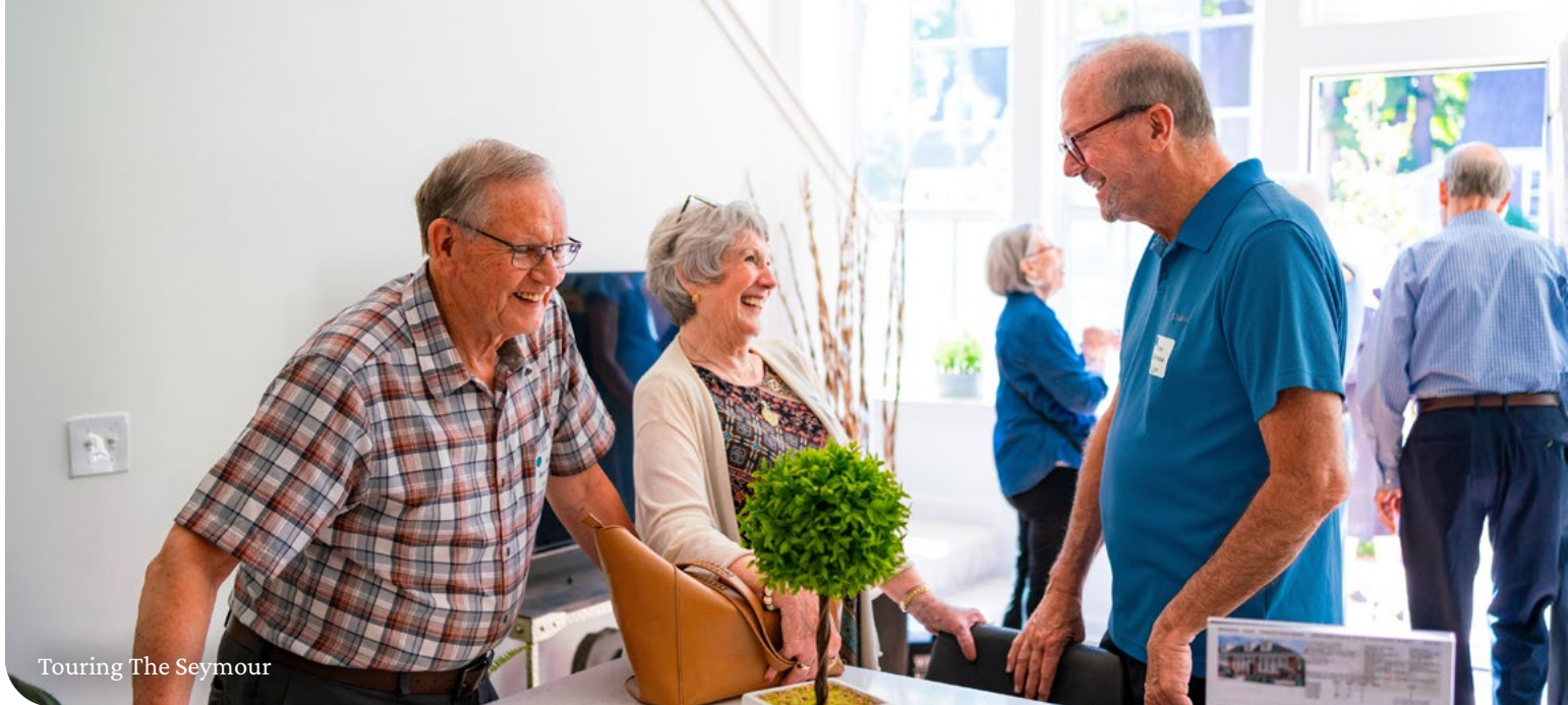
Touring The Seymour