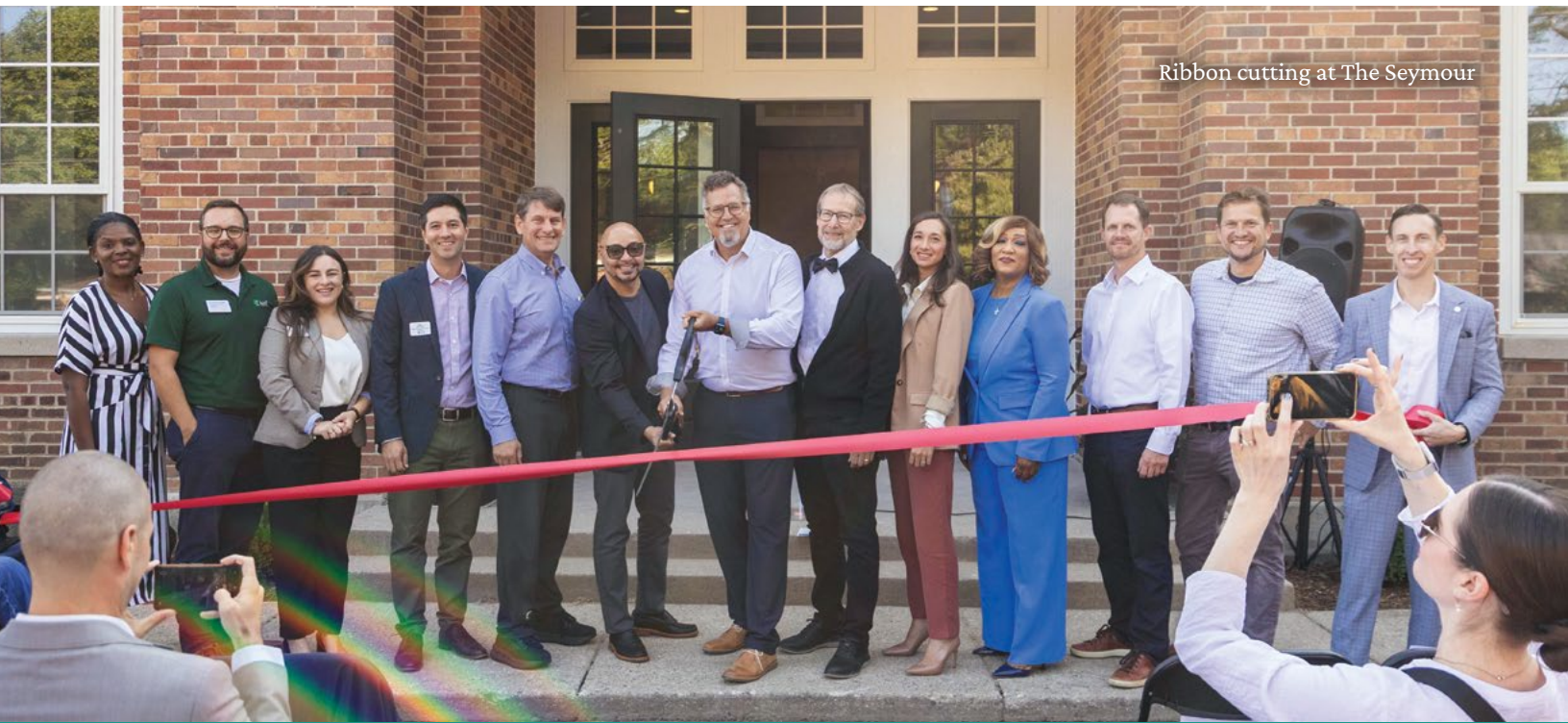
Ribbon cutting at The Seymour

415 Martin Luther King Jr. St. SE, Suite 100 Grand Rapids, MI 49507